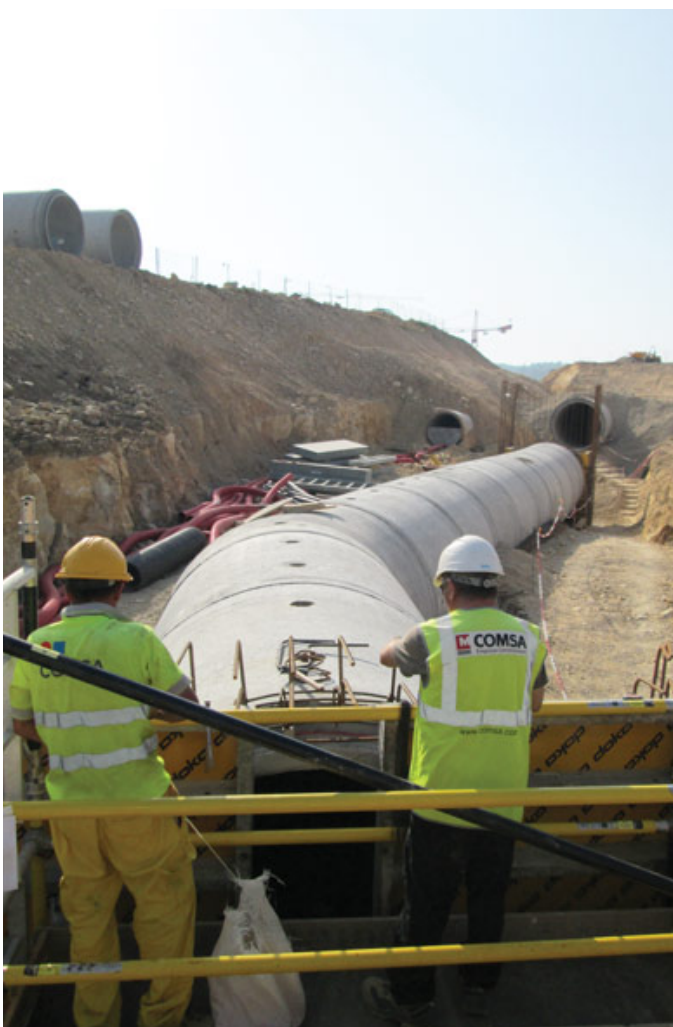
The precipitation drainage system, located underneath the galleries, is implemented prior to galleries works

The awarded contract involves the construction of 12 reinforced concrete galleries which host Safety Important Component (SIC) related systems such as cooling water pipes and power supply cables of the networks that need to be visited and maintained during the lifecycle of the ITER machine. The total length of galleries will measure 650 metres, with particular sections measuring an impressive 12 metres in width and 6 metres in height. In total, 10,000m 3 of earth is being moved in excavation (earthworks) and 5,000 m 3 of concrete is being used. The awarded contract also comprises the precipitation drainage, i.e. the water collected from on and around the Tokamak and Assembly buildings, where in total the length for rain water drainage involves 800 metres of gravity pipework with diameters ranging from 400 millimetres to 1,400 millimetres.